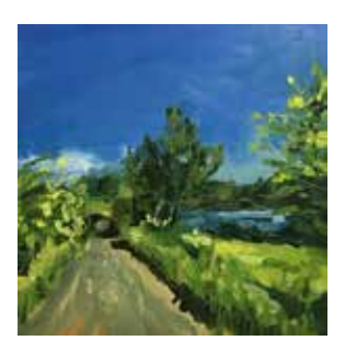
8. Mud Island Road Approx. 65cm wide x 65cm high. Oil on board. $1500

* Whilst all care has been taken to provide reliable representations of the artwork through these images, some external margins of the artworks may have been cropped and colour accuracy cannot be guaranteed.