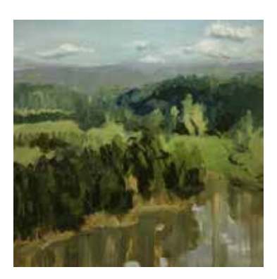
7. The Old River Approx. 85cm wide x 85cm high. Oil on board. $2400