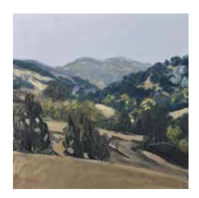
5. Just Past Sofala II Approx. 85cm wide x 85cm high. Oil on board. $2400