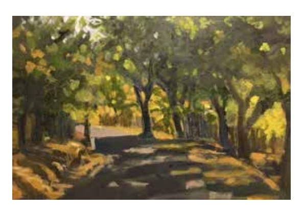
2. Welcome to Hill End Approx. 125cm wide x 84cm high. Oil on board. $2800