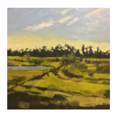
1. Last Light - McGraths Hill Farm Approx. 85cm wide x 85cm high. Oil on board. $2400